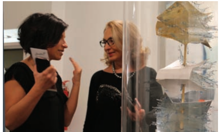
Staff | staff@swspotlight.com

"I use all the natural elements, water, fire, air, in